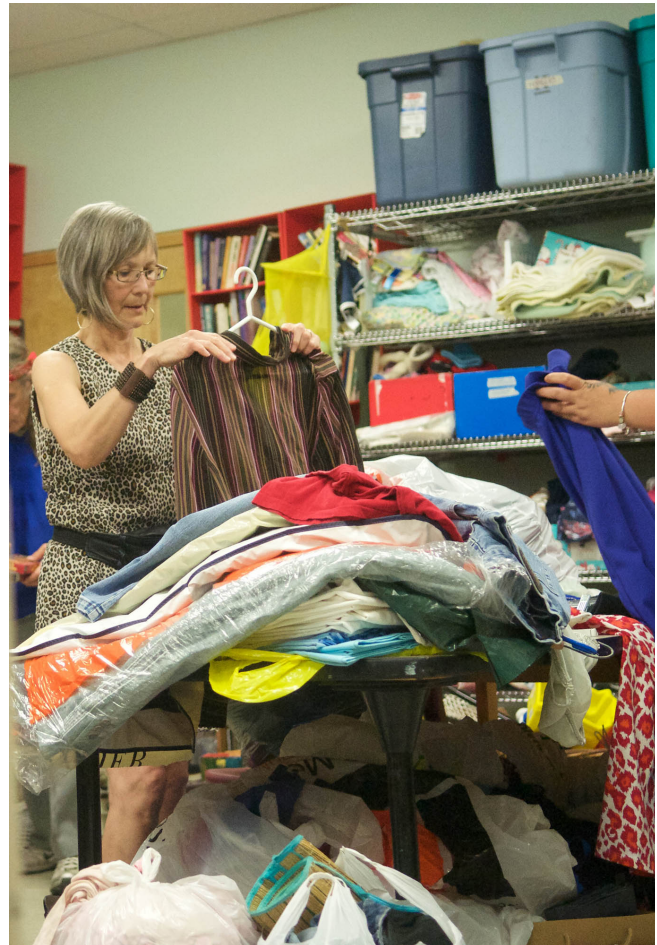
The clothing boutique continues to outfit clients for affordable prices. Many clients come to see us for an outfit for special occasions.

Your generous gifts include finances and food from your streets, churches, businesses, birthday and anniversary food drives. We even had one grade six student collect food on Hallowe'en, in place of candy to support those who are hungry in our community. She has learned about giving through the "We to Me" Program that encourages youth to think of others. She dropped off "Scare Hunger